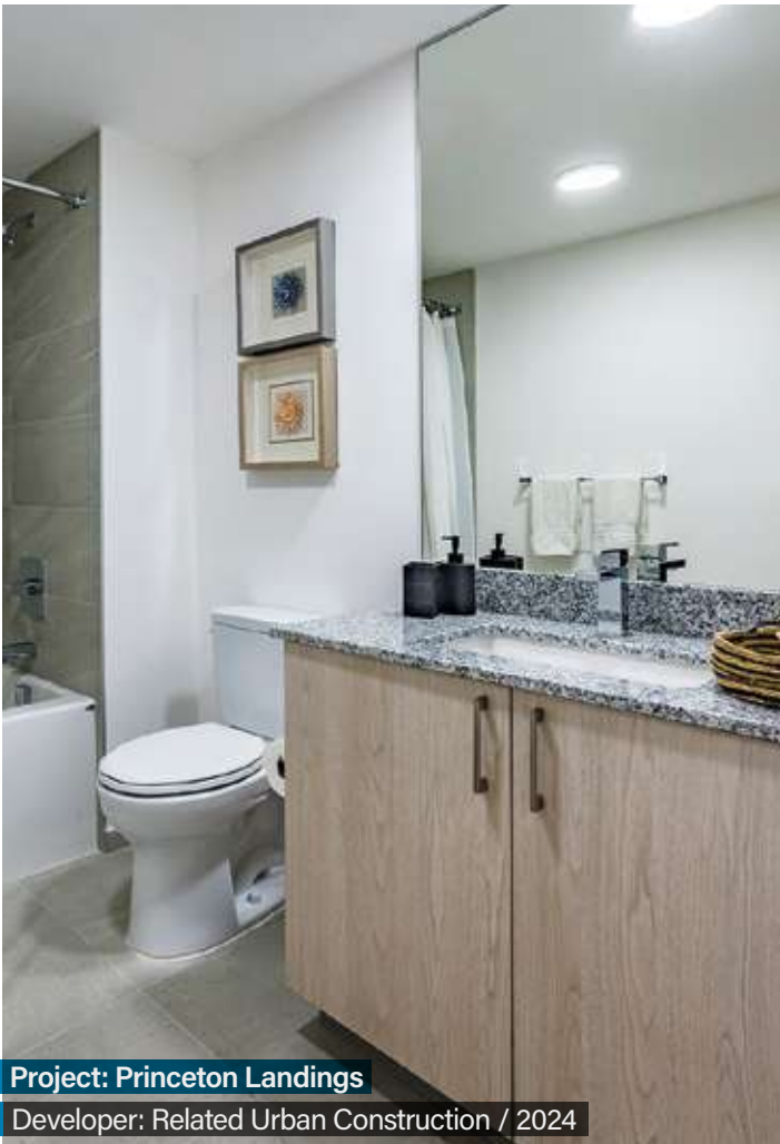
Project: Princeton Landings

Developer: Related Urban Construction / 2024