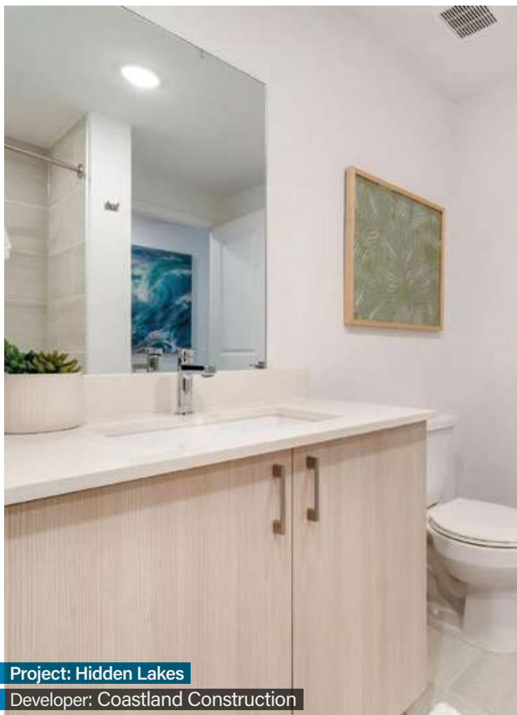
Project: Hidden Lakes