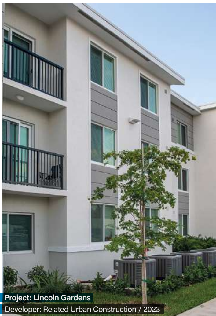
Project: Lincoln Gardens

A Miami residential complex that blends affordability with modern aesthetics, featuring wood cabinets, granite countertops, and vinyl flooring. Our efficient cabinetry solutions, including pre-packaged, easy-to-assemble components, streamlined the installation process, optimized timelines, and maintained on-site quality.