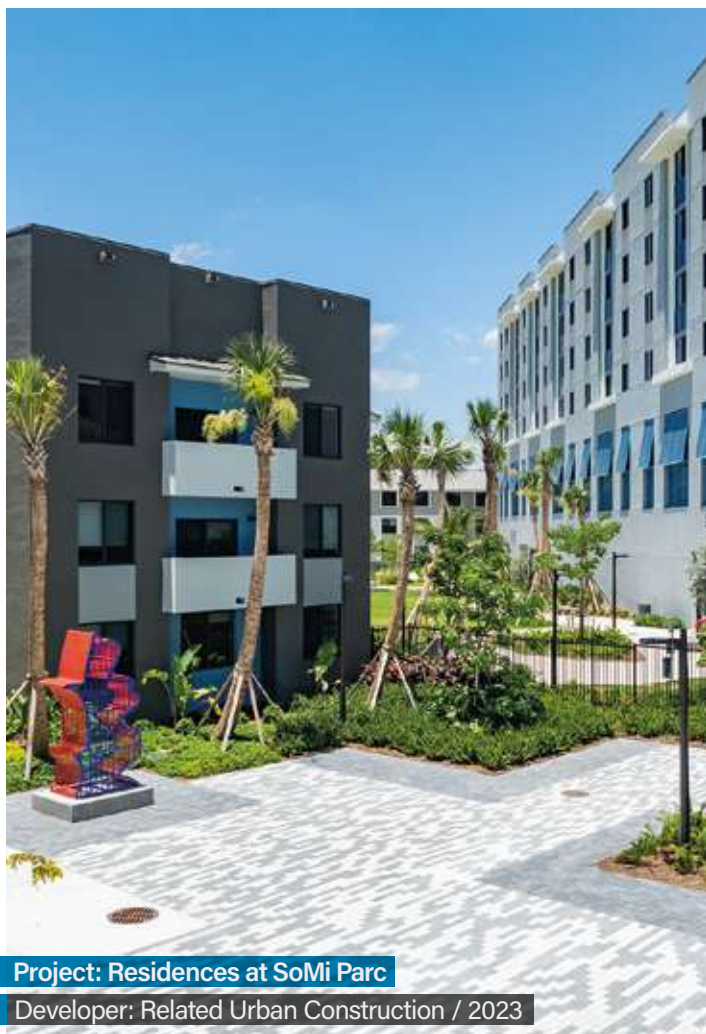
Project: Residences at SoMi Parc

A modern and sustainable residential development in South Miami, strategically located near transportation, schools, and entertainment. Our innovative cabinetry solutions, including easy-to-assemble cabinetry and protective packaging, helped accelerate construction and maintain high-quality finishes.