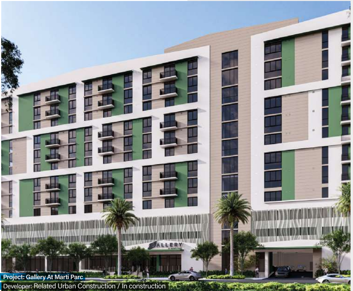
Project: Gallery At Marti Parc

Our easy-to-assemble furniture helps maintain the project's pace with precision and efficiency from the assembly stage onward.