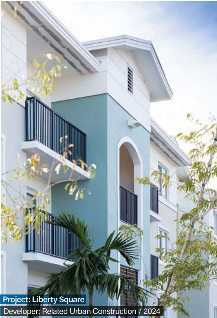
Project: Liberty Square

Developer: Related Urban Construction / 2024